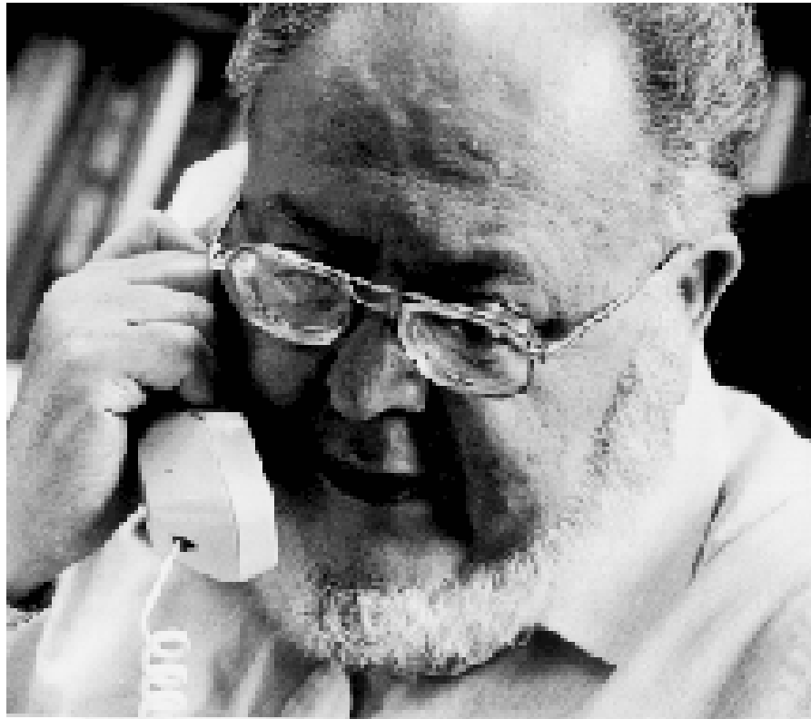
Herman Kahn 1922-1983