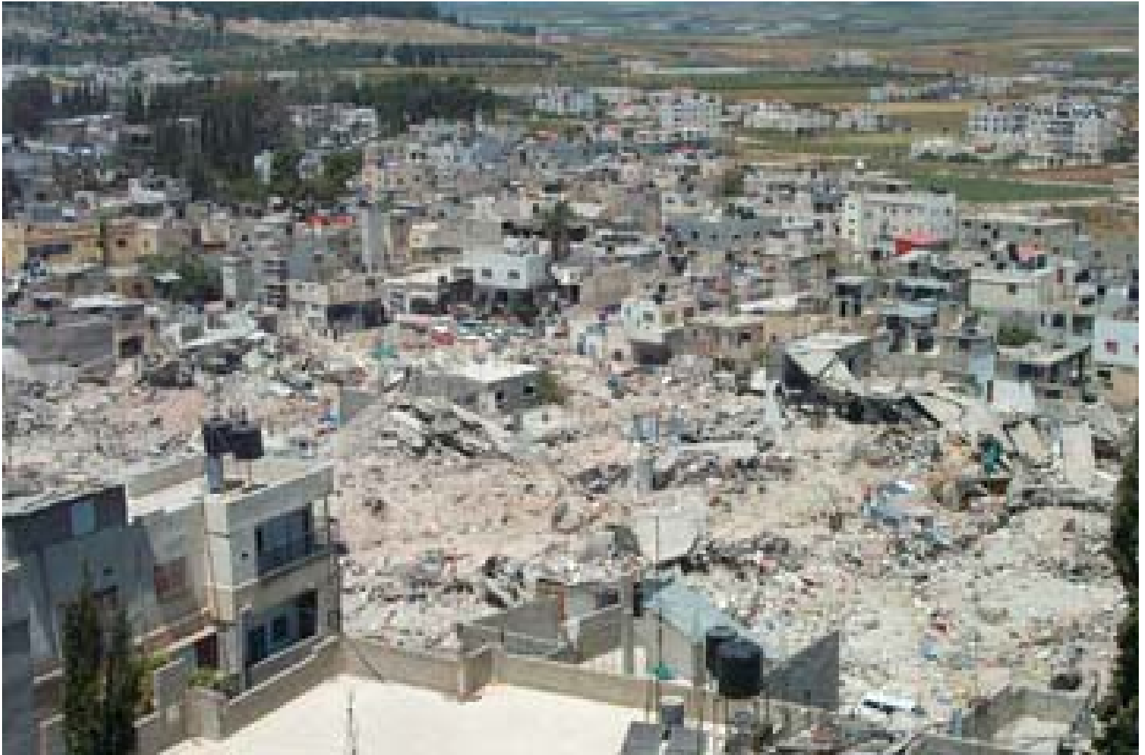
Jenin after Pacification