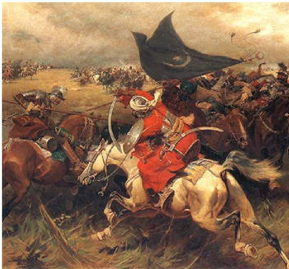
Battle of Vienna Sept 11 1683