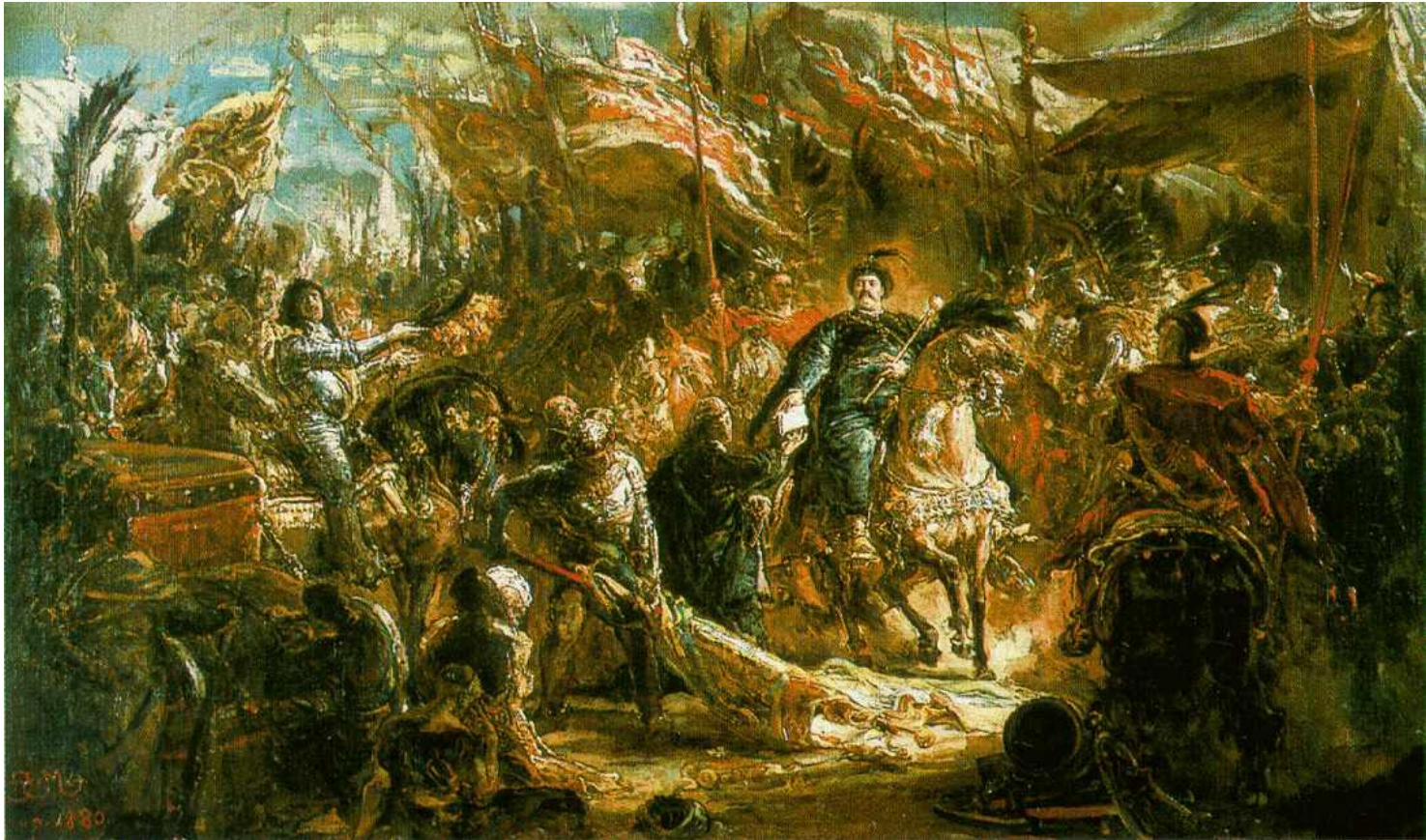
Battle of Vienna Sept. 12, 1683