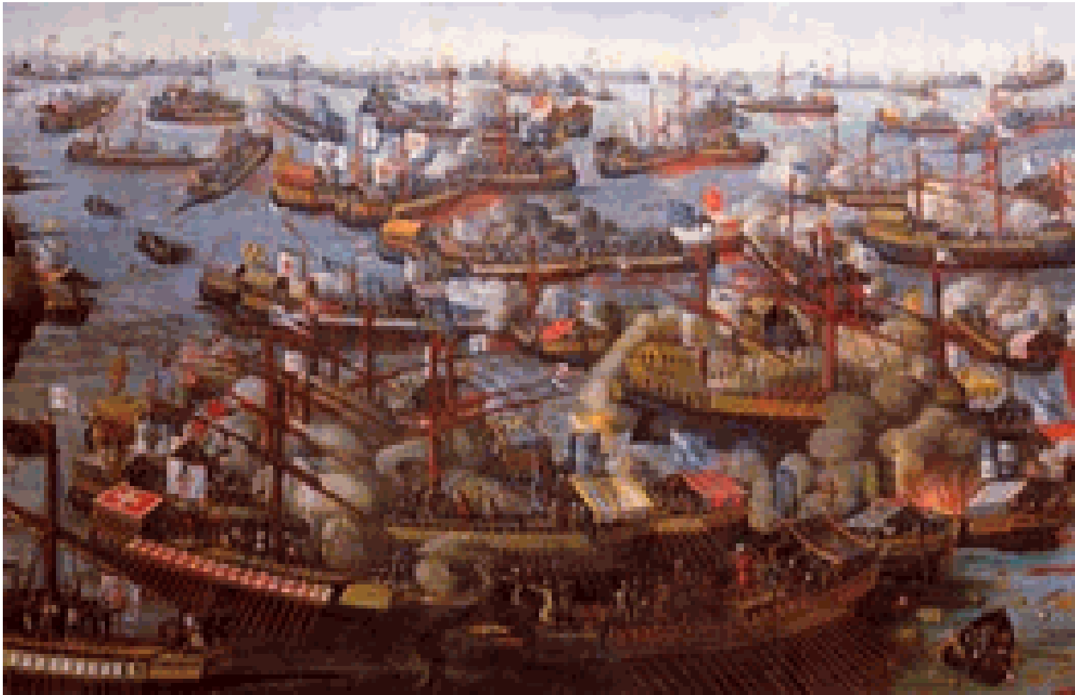
Battle of Lepanto, Oct 7, 1571