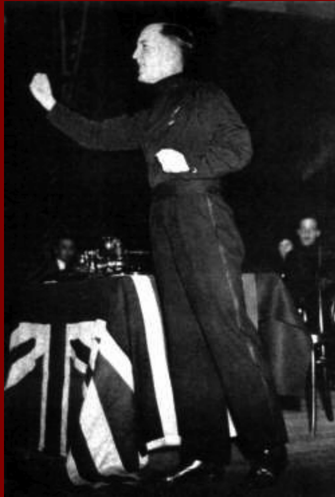
Lord Haw Haw